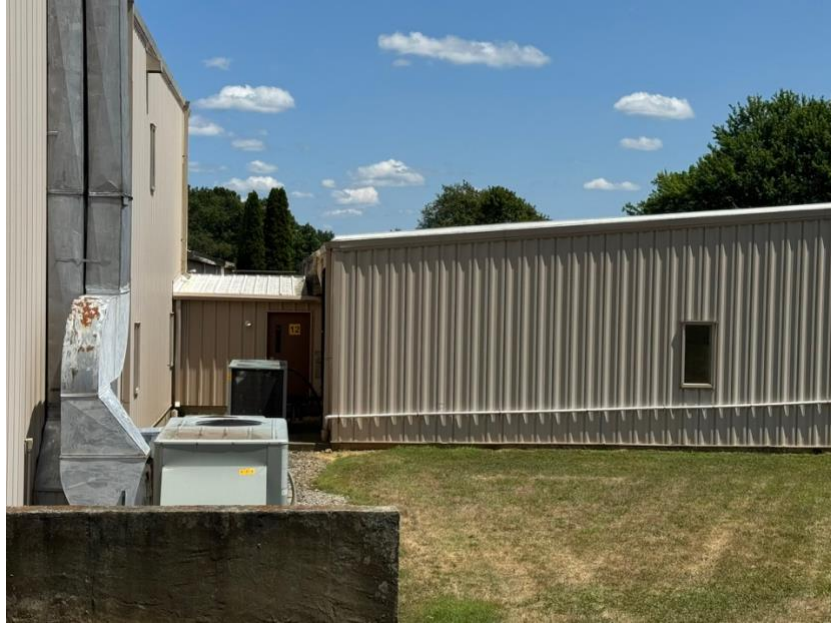
Figure 2: Ledge where Crooks was photographed by AGR Building