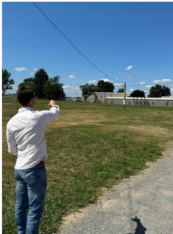
Figure 1: Senator Hawley standing at the Butler Farm Show Grounds pointing toward AGR Building 6

Senator Hawley also spoke to agents from the Federal Bureau of Investigation, who denied him access to the site and demanded that he leave.