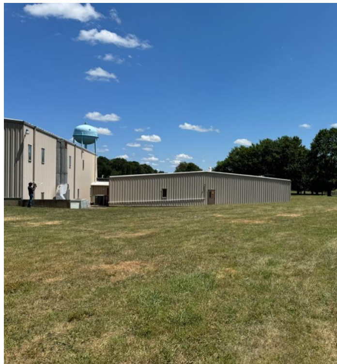
Figure 3: View of AGR Building 6 showing slope of roof